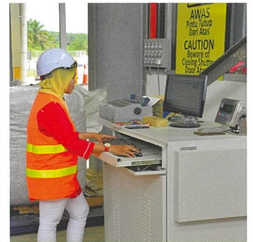
Computerised floor scale