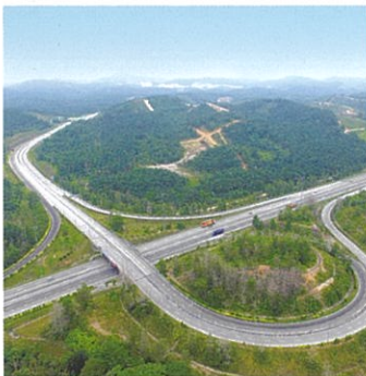
Direct access from PLUS