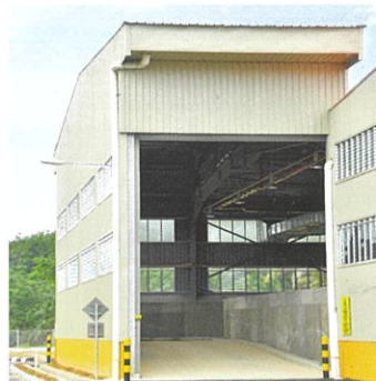
All-weather bulky waste unloading bay