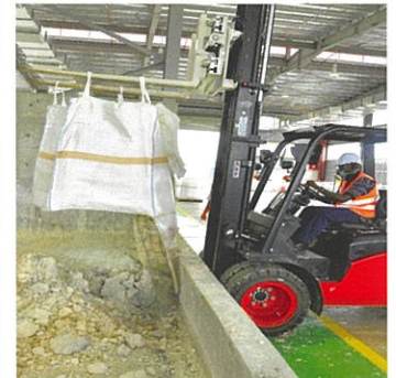
Material processing zone