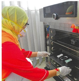
Integrated laboratory for material analysis