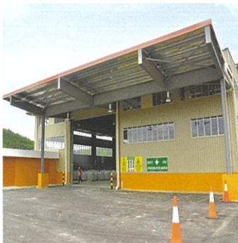
All-weather packaged waste unloading area