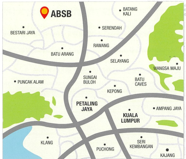
ABSB SUSTAINABLE RESOURCE MANAGEMENT CENTRE

ABSB's plant is situated in an area that is earmarked by the authorities as an integrated waste management centre (which also houses the Bukit Tagar sanitary landfill, the largest sanitary landfill in the country built and operated by ABSB's related company). The plant is surrounded by a 500 metre buffer zone, the largest full-fledged buffer zone in any waste management facility in the country.